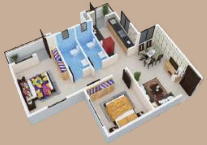
1 BHK TYPICAL FLOOR PLAN